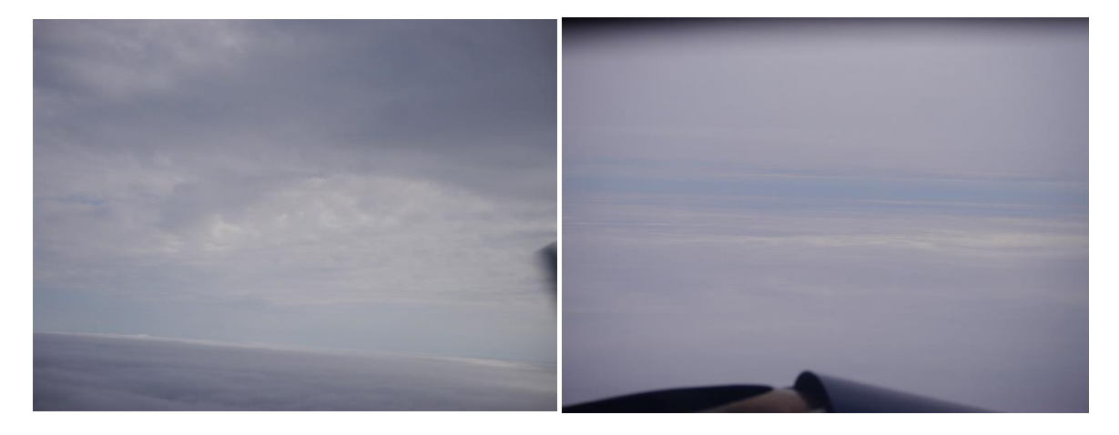
Multi-layer structure of the clouds observed west of Svalbard.