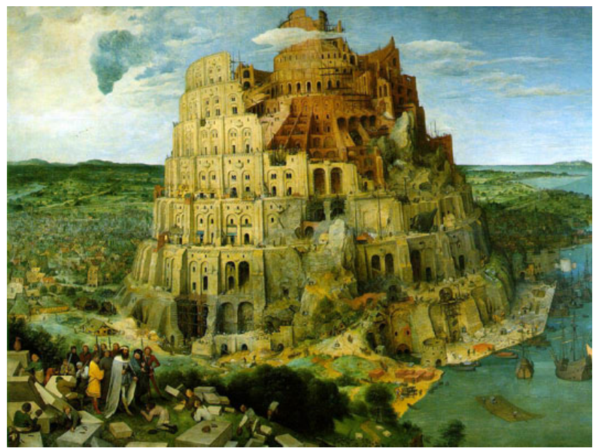
The building of the tower of Babel by Pieter Bruegel, 1563 Oil on oak panel, Kunsthistorisches Museum, Vienna